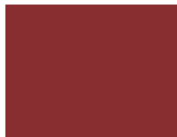
82 Red Velvet