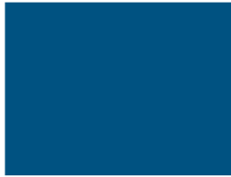
15 Blue Streak