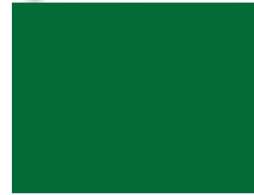
18 Verdant Green