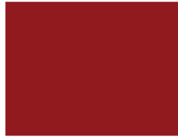
16 Red Baron