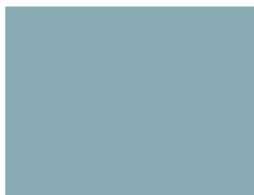
80 Crystal Cave